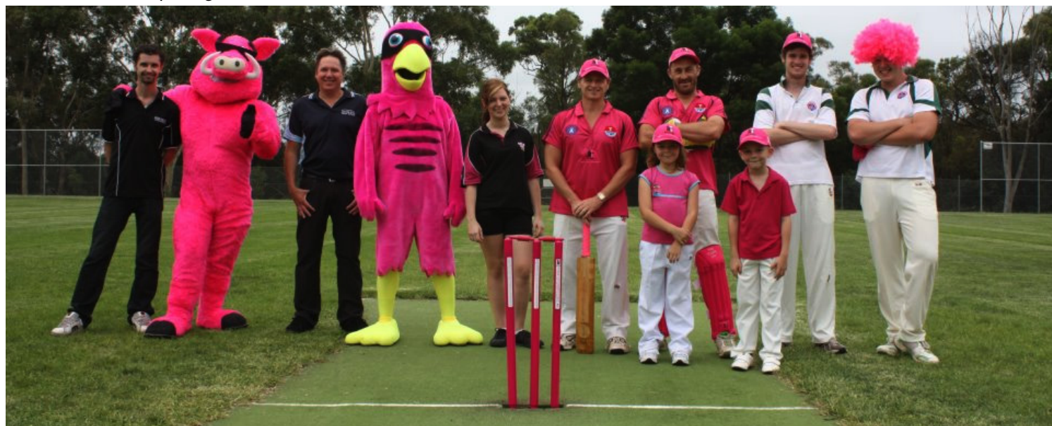
Castle Hill RSL (above) at Fred Caterson 2 all day Sunday (February 19th) and all matches on Saturday

The inaugural Pink Stumps Day saw more than 650 clubs raise over half a million dollars to help us achieve our goal of placing McGrath Breast Care Nurses in communities right across Australia and increasing breast awareness in young women.