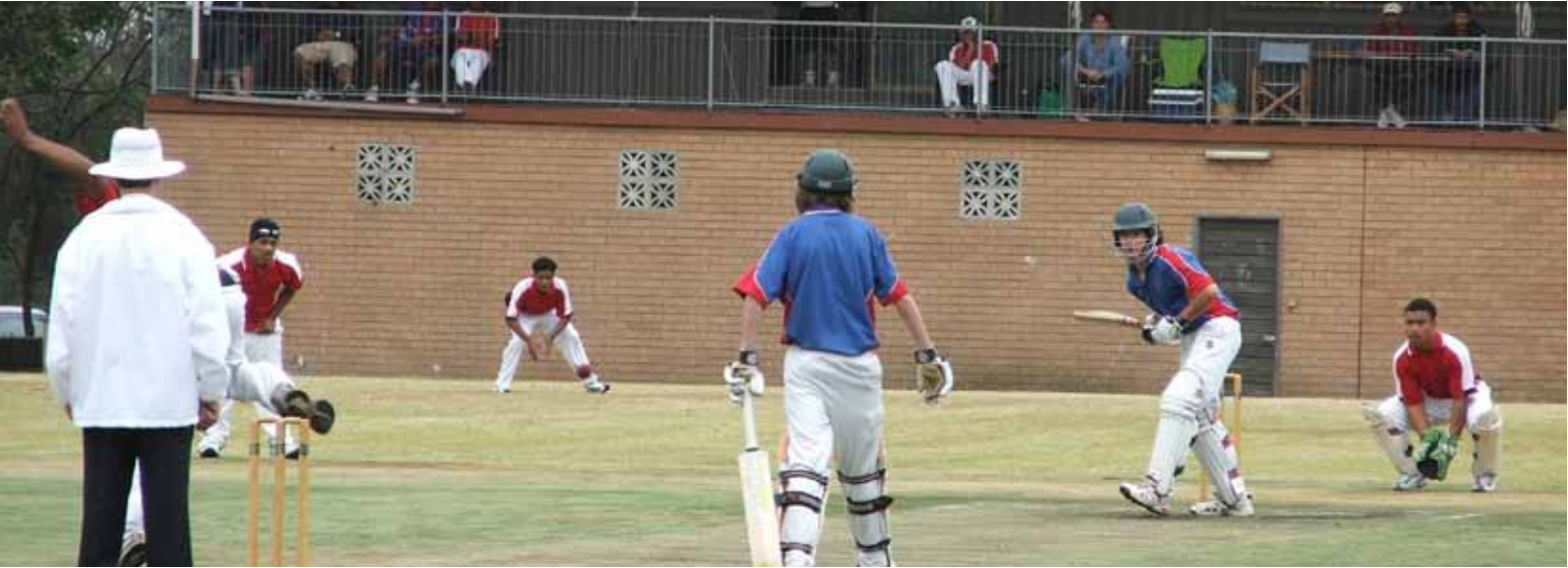
Photo: Action underway at Kenthurst Oval Number 1 (setting for upcoming coaching clinic).