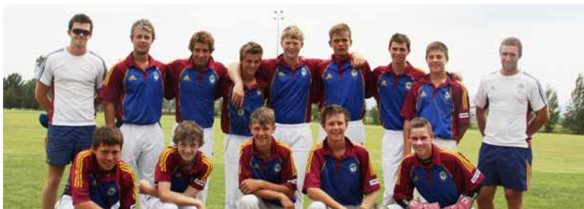
Photo : Northern District CC Green Shield team in 2009-10.

A W Green Shield is the premier junior cricket competition in Australia and is played by all 20 Sydney Grade Clubs. It is considered the toughest and most competitive Under 16 competition in the world and is the stepping stone for juniors coming into the grade ranks. Greenies as it is more commonly known, consists of 7 preliminary rounds, qualifying finals, semi-finals and a Final. Many of NSW's top cricketers have come through this prestigious competition.